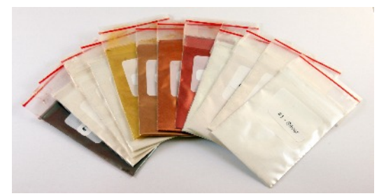
LTK-1 Trial Pack, 12 colours

Used as a surface application which results in a "metal-flake" or "sparkle" appearance. Stabilized for glass, glazed ceramic and enameled metal applications. Available in twelve lustrous colors: clear silver, purple, blue, green, yellow, orange, red; metallic red, orange, yellow, gold & green.